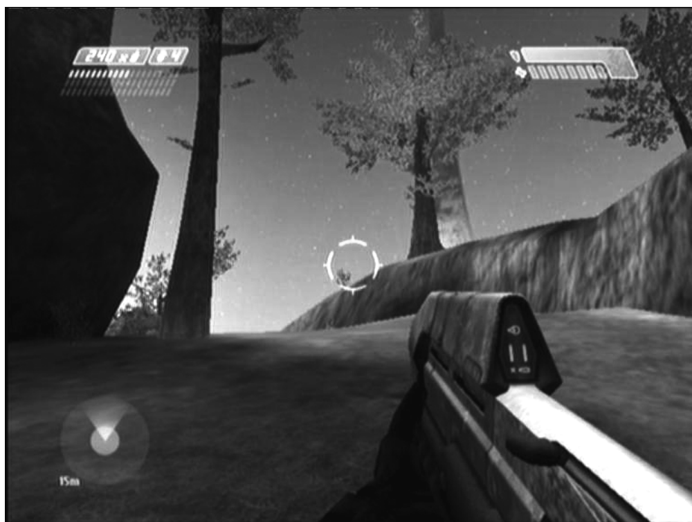
Figure 2: Subjective point of view in Halo (2001)