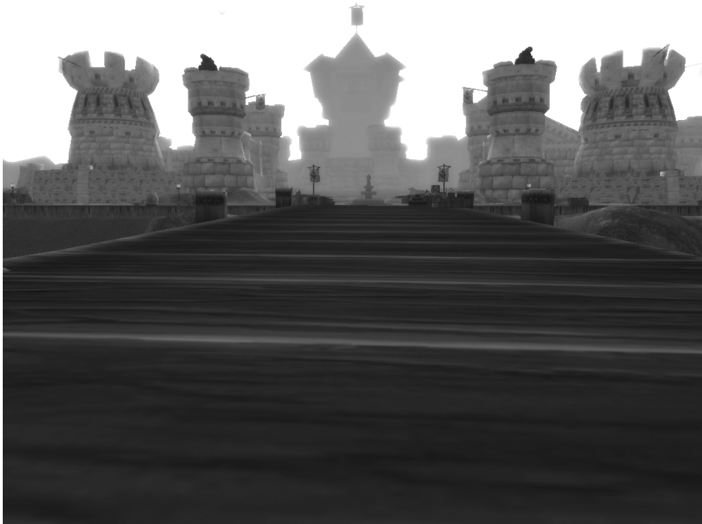
Figure 8: Subjective point of view in World of Warcraft (2004)