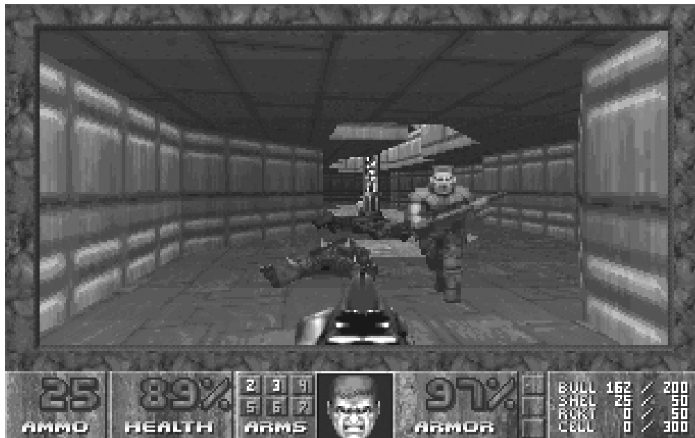
Figure 1: Subjective point of view in Doom (1993)