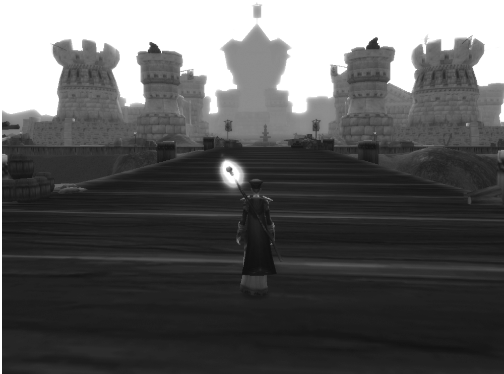
Figure 4: Semi-subjective point of view in World of Warcraft (2004)