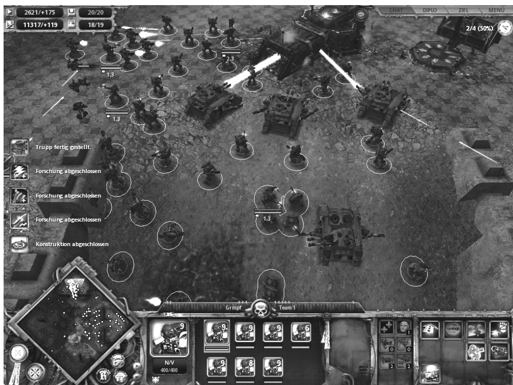
Figure 6: Objective point of view in Warhammer 40.000: Dawn of War (2004)