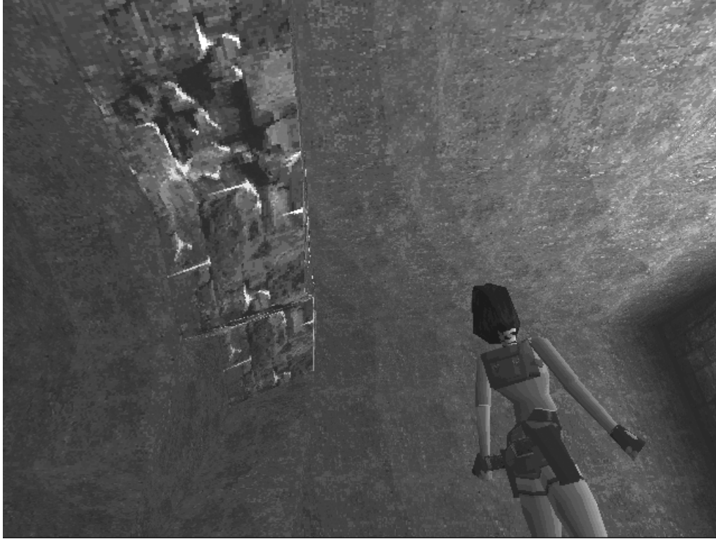
Figure 7: Lara Croft in Tomb Raider (1995), looking to her upper-left hand side