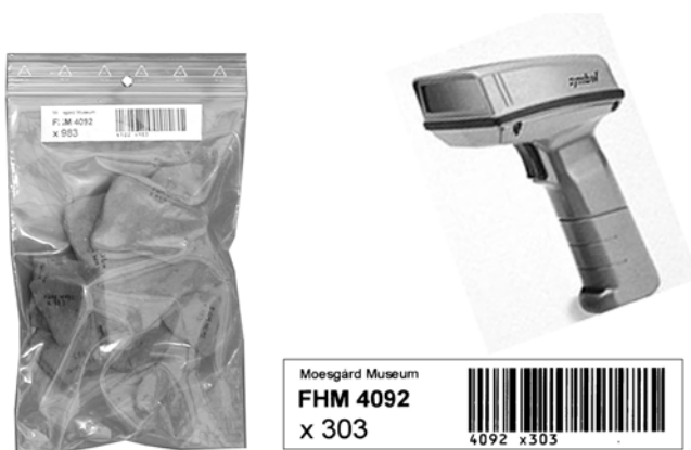
Figure 5. Registration of finds using pre-printed labels.

All finds are recorded during fieldwork with a pre-printed label containing barcode information. These pre-printed labels prevent double entries and the barcode facilitates further work and registration of the objects.