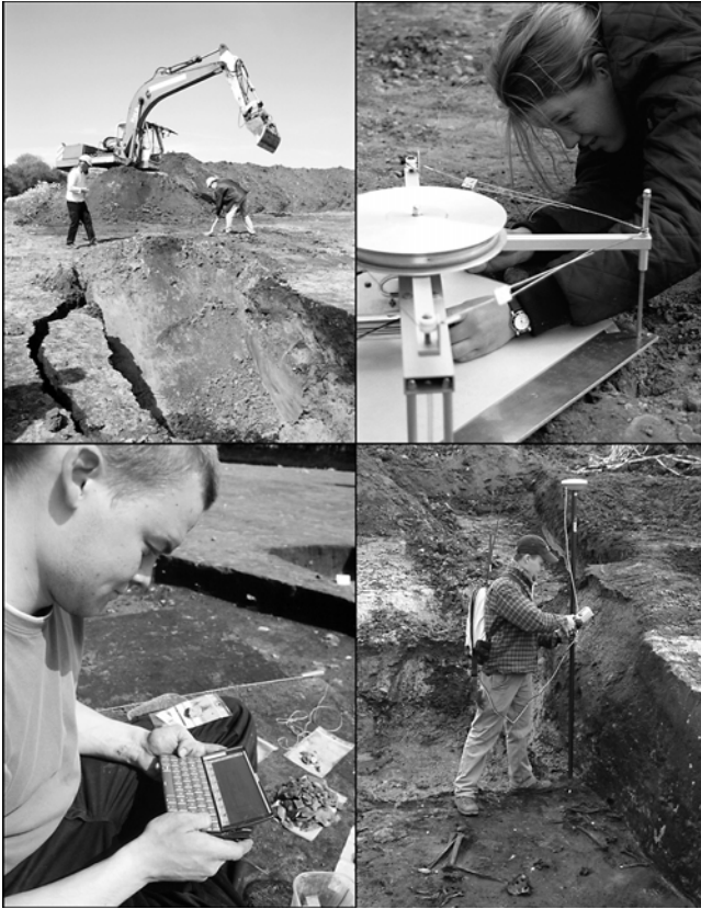
Figure 2. "Hardware" for fieldwork. Working with a field pantograph, handheld computer and GPS survey equipment.

As basic elements in the fieldwork we have introduced: Handheld computers, field pantographs and GPS survey equipment combined with software from Microsoft Access and MapInfo .