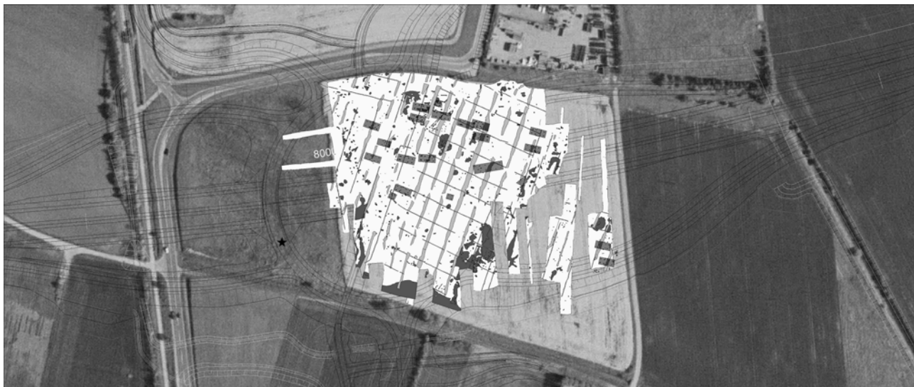
Figure 4. Digital area plan. Example of an excavation plan digitised in MapInfo superimposing an ortophoto

all relevant map material in a structure of layers containing administrative as well as archaeological maps. Behind the digital maps you have the tabular data linked to the objects in the layers. By these data you get the opportunity to carry out advanced search and analysis.