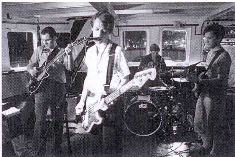
British Sea Power, Core Quartet

ground? On the one hand, it is clearly parallel to John Greenwood's original music in tapping into an available musical vocabulary. While Greenwood relies on the romantic convention of reworking folk melodies in an orchestral context, signifying an organic fusion of nature and nurture or nation in the process, British Sea Power similarly relies on rock music's romantic claim to authenticity. On the other hand, the main difference between the two projects is, obviously, that Greenwood could still rely on a fairly intact cultural framework with widely accepted conventions, while British Sea Power cannot: Just like romanticism's claims to naturalness and organicism, rock music's claims to authenticity have been thor-