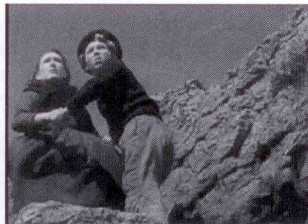
Film stills from Flaherty's film Man of Aran (1934); 23:38 (left) and 1:05:05 (right)

gone out to sea once again, while the boy and his mother go about their domestic cores. As a storm rises, they are increasingly worried and their gazes go out to an increasingly menacing sea with increasing frequency while the wind howls with increasing intensity (see right film still above). Finally, the tiny curragh comes into view amidst towering waves, and in a fairly literal repetition of the earlier return scene the film comes full circle – only that this time the boat is completely destroyed, providing a skeleton-like memento mori before the family wanders home again barely sheltered from the towering seas. As the titles of BSP's final tracks indicate, the music, though instrumental, adopts the film's rapprochement with its protagonists by toning down the 'post-rock' elements prevalent in some earlier sections. Both the increasing suspense of the mounting storm and the boat's dramatic return are accompanied by more straightforward rock pieces ultimately carried by electric guitars, while the heroic human perspective is clearly marked by a crystal-clear cornet line in 'It Comes Back Again' before it is joined by the guitars laying the groundwork for a long anthemic crescendo