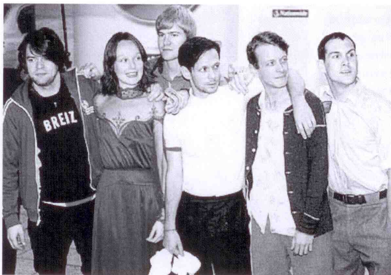
British Sea Power (Sestet) at Mercury Award Ceremony (2008)

from particularly dramatic scenes such as the excited shouts and commands of the men in their frail boat while they are hunting down the shark, the new soundtrack tends to shift between 'post-rock' noise whenever the materiality of being comes into focus and tentative musical forms whenever human activities beyond the immediate reach of material adversity are addressed. Accordingly, the most conventional track is the folk song 'Come Wander With Me' (track 3) introduced by viola and