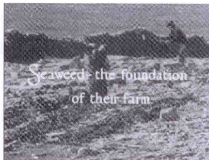
Film still from Robert Flaherty's Man of Aran , 1934, 18:21

With the fervor of a poet and the skill of a magnificent cameraman [Flaherty] examines the theme which lies close to his heart, the grim and ceaseless struggles of primitive beings to preserve their lives against the crushing assaults of their environment [...] he strips his new work of dramatic artifice and plunges to the heart of earthy and basic experience. It is bare, cruel and authentically real; it is ardent with life, and it represents the pure cinema at its best. 3